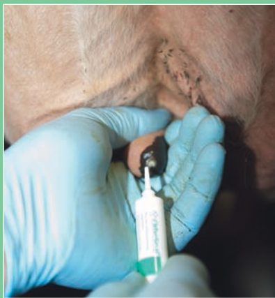
Applying teat sealant