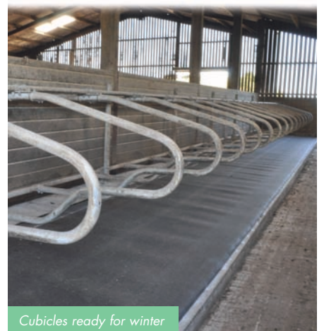
Cubicles ready for winter

Some changes to housing management were required. Paul explains: 'In the dry cow shed, we started to apply hydrated lime onto the straw to help kill bacteria. And we now clear all the straw out half-way through the winter. Also, the mats in the milking cows' cubicles are spread with sawdust into which hydrated lime has been added. These mats are cleaned off twice each day, and fresh sawdust applied.'