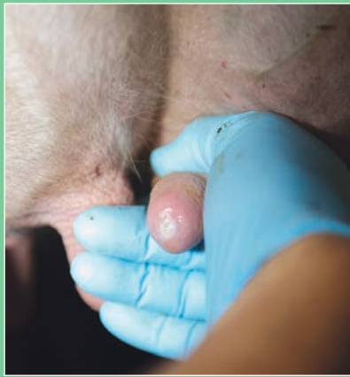
Smooth teat end

Paul has been able to cull out some older high cell count cows and now rolling cell counts are around 100,000 cells/ml. The mastitis incidence in freshly calved cows is now down to around 1.5 cases per 12 cows.